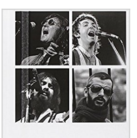
still the greatest THE ESSENTIAL SONGS OF THE BEATLES' SOLO CAREERS ANDREW GRANT JACKSON